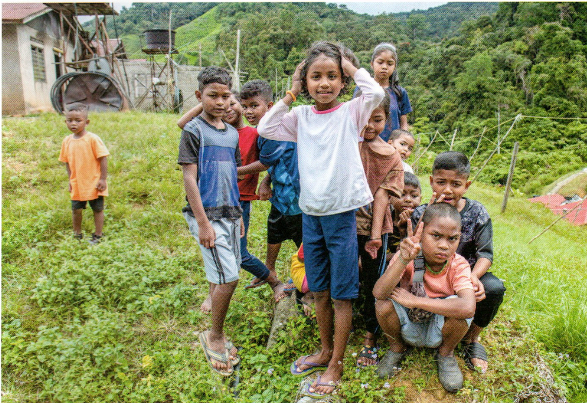
Pastors in Malaysia report that Islamization efforts among tribal groups have led to a “silent persecution” of Christians in the country.